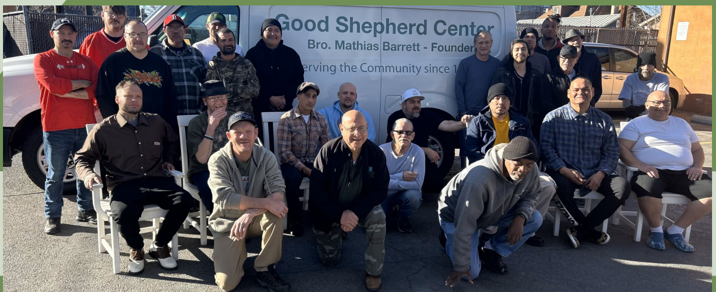
Our Current Clients